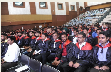
Degree recipients waiting for conferment of their degrees in third convocation.