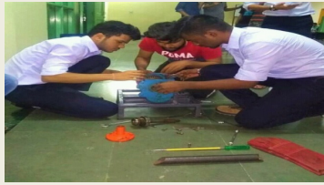
“Automobile gear box assembling and dissembling” an activity by MES held on November 21, 2018.