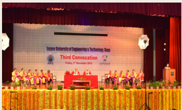
Third convocation held on November 02, 2018.