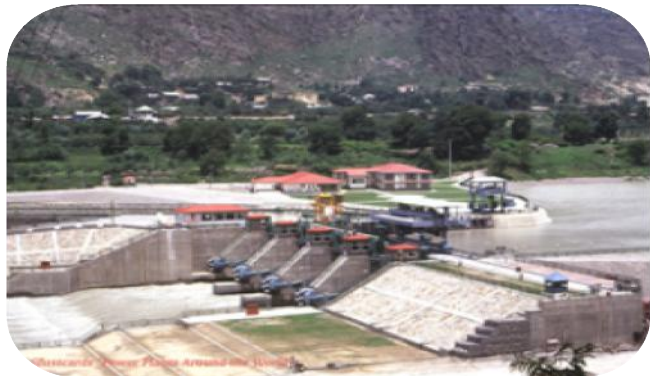
Jaypee Hydropower Plant